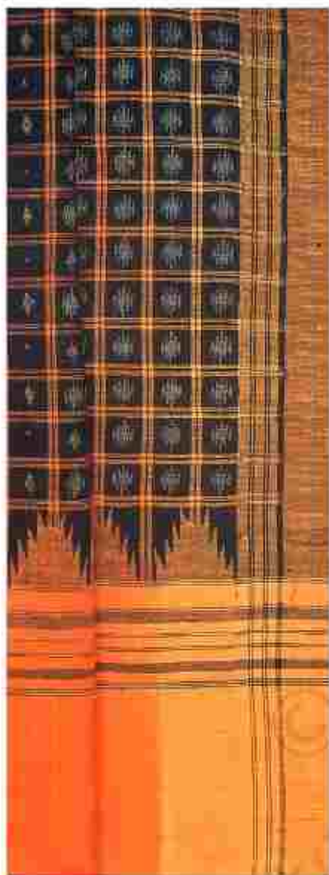
Fig. 5.10 Ikat weaving patterns such as this were adopted and modified at several coastal production centres in the subcontinent and in Southeast Asia.

➤ Why do you think Ibn Battuta highlighted these activities in his description?