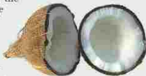
Fig. 5.1b A coconut

In a few cases, travellers did not go to distant lands. For example, in the Mughal Empire (Chapters 8 and 9), administrators sometimes travelled within the empire and recorded their observations. Some of them were interested in looking at popular customs and the folklore and traditions of their own land.