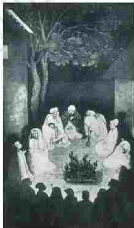
Fig. 5.5 An eighteenth-century painting depicting travellers gathered around a campfire

Compare the objectives of Al-Biruni and Ibn Battuta in writing their accounts.