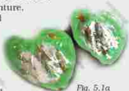
Fig. 5.1a Palm leaves

Women and men have travelled in search of work, to escape from natural disasters, as traders, merchants, soldiers, priests, pilgrims, or driven by a sense of adventure. Those who visit or come to stay in a new land invariably encounter a world that is different: in terms of the landscape or physical environment as well as customs, languages, beliefs and practices of people. Many of them try to adapt to these differences; others, somewhat exceptional, note them carefully in accounts , generally recording what they find unusual or remarkable. Unfortunately, we have practically no accounts of travel left by women, though we know that they travelled.