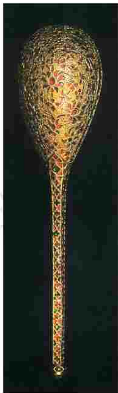
Fig. 5.12 A gold spoon studded with emeralds and rubies, an example of the dexterity of Mughal artisans

➤ In what ways is the description in this excerpt different from that in Source 11?