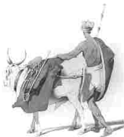
Fig. 5.11 Drawings such as this nineteenth-century example often reinforced the notion of an unchanging rural society.

As an extension of this, Bernier described Indian society as consisting of undifferentiated masses of impoverished people, subjugated by a small minority of a very rich and powerful ruling class. Between the poorest of the poor and the richest of the rich, there was no social group or class worth the name. Bernier confidently asserted: "There is no middle state in India."