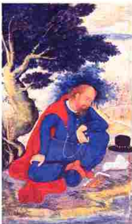
Fig. 5.6 A seventeenth-century painting depicting Bernier in European clothes.